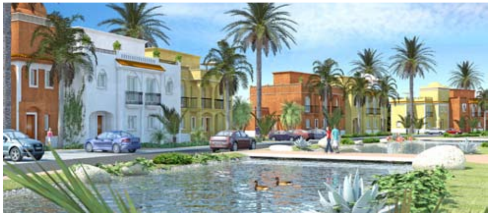
Le Village de Sport townhouses

New imagery of Le Jardin de Fleur's invitation-only resort, Le Village de Sport, has recently been released. Le Village de Sport is one of two resorts that are exclusively endorsed by some of England's finest footballers, John Terry, Rio Ferdinand and Gary Neville. A special event is being planned by the players in May to promote Le Jardin de Fleur and the new destination of Meditterania Saïdia.