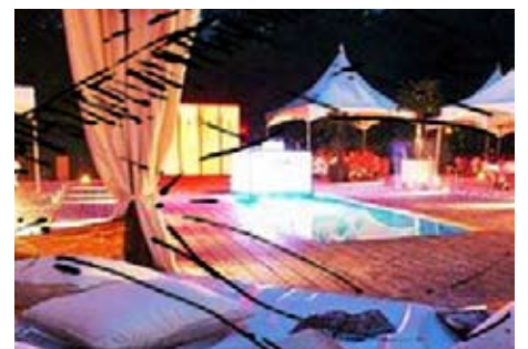
Architect's concepts of beach club